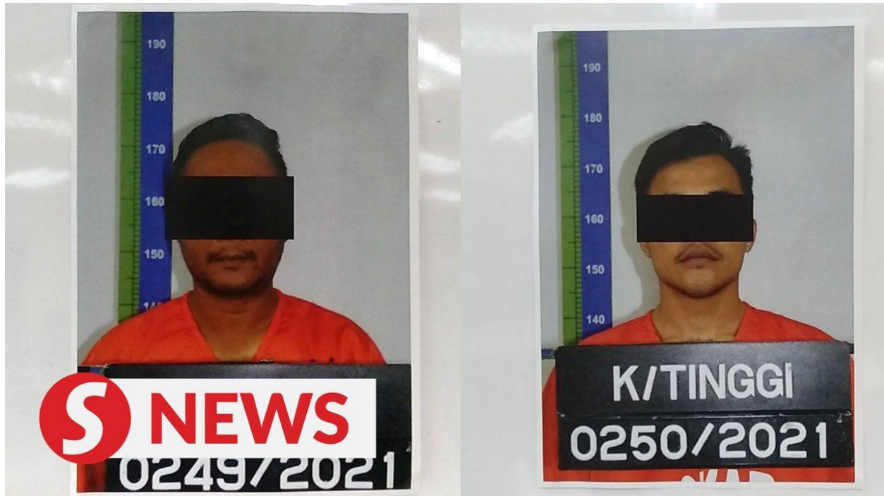
Figure 5: Two suspects